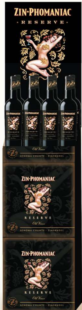
Case Stack with case card (Item #15-0001-02)